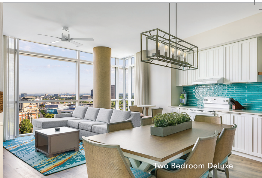
Two Bedroom Deluxe