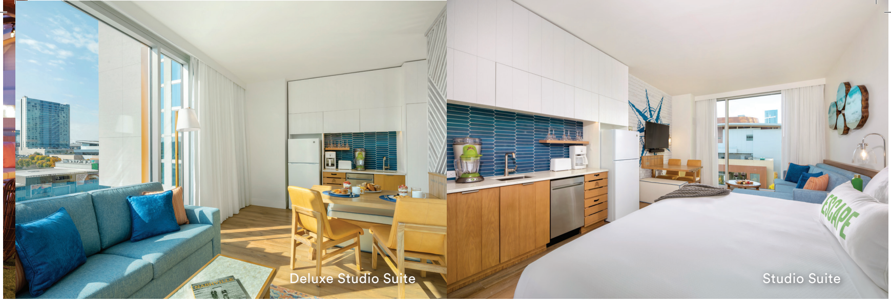
Deluxe Studio Suite