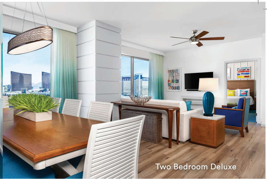
Two Bedroom Deluxe