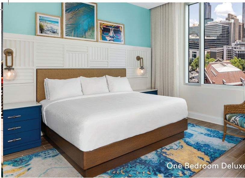
One Bedroom Deluxe